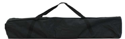
Nylon Travel Bag