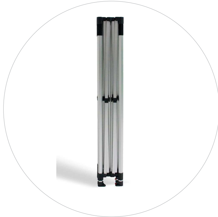
(qty 1) Canopy Frame