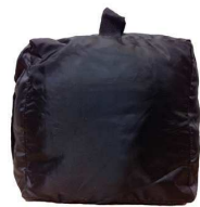
Optional Sand Bag