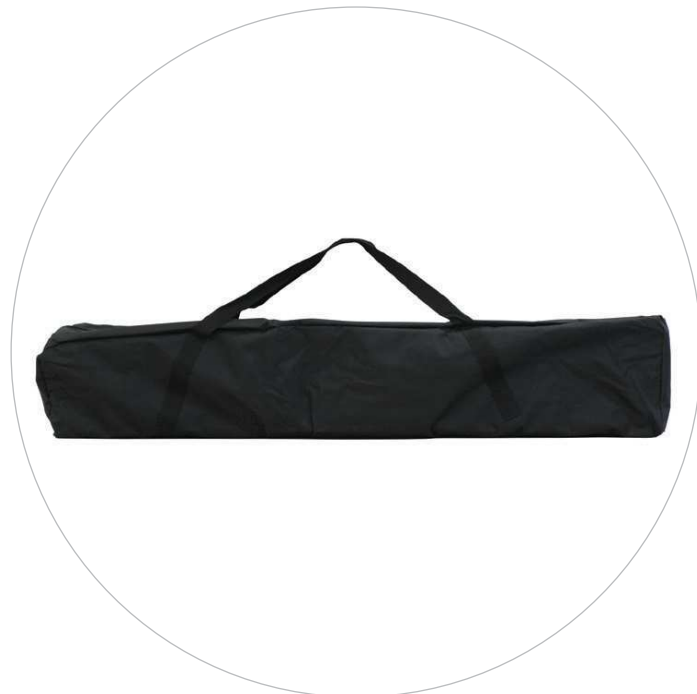
(qty 1) Travel Bag