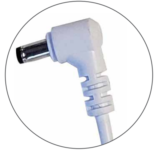
Qty.1 - 6' DC Cable