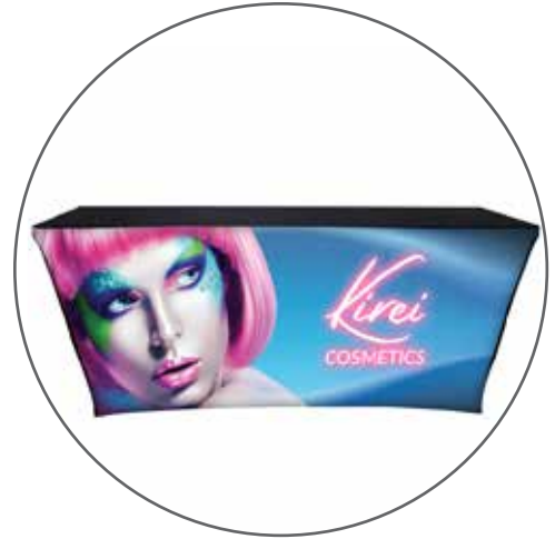
Qty.1 - 4 Sided Graphic w/ Full Color Front Side