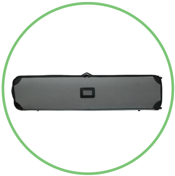
QTY 1: Silverbag

Outside Dimensions: • 48 1/2" W x 12 1/2" H x 6 1/2" D Inside Dimensions: • 48" W x 12" H x 6" D