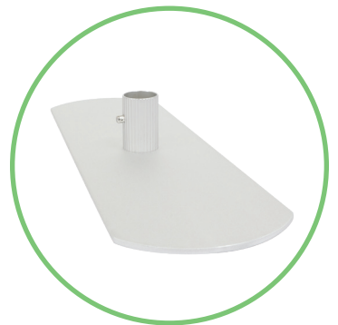
QTY 2: Feet • 19 3/4" L x 6 1/4" W x 2 1/2" H