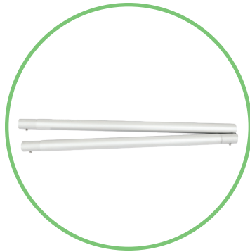
QTY 1: Bottom Horizontal Tube Set

Outside Dimensions: • 48 1/2" W x 12 1/2" H x 6 1/2" D Inside Dimensions: • 48" W x 12" H x 6" D